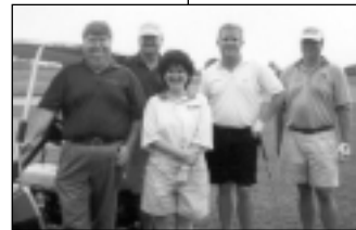
Tournament sponsors, Ackerman Credit Union